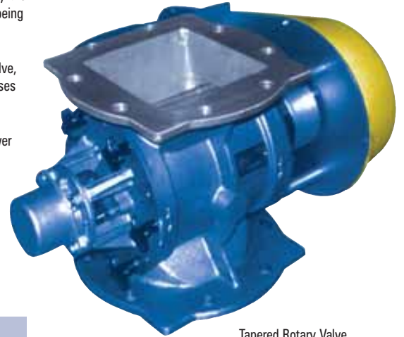
Tapered Rotary Valve

These collars are tightened each side of the relevant outboard bearing once the setting has been achieved.